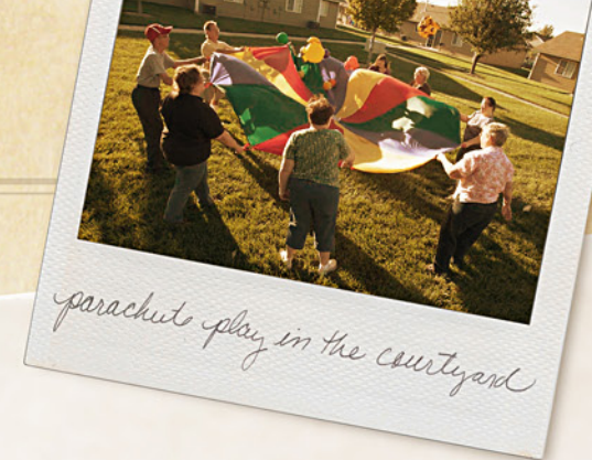
parachute play in the courtyard